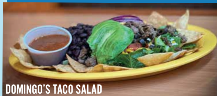
DOMINGO'S TACO SALAD

Refried or black beans, variety cheese, lettuce, your choice of meat, avocado, tomatoes, and red onions, served with homemade tortilla chips and our house red salsa on the side - 14.99